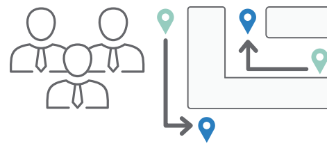
HR queries contact tracing SW