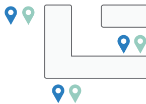
Data streamed to visualization and AI/ML Proximity Models