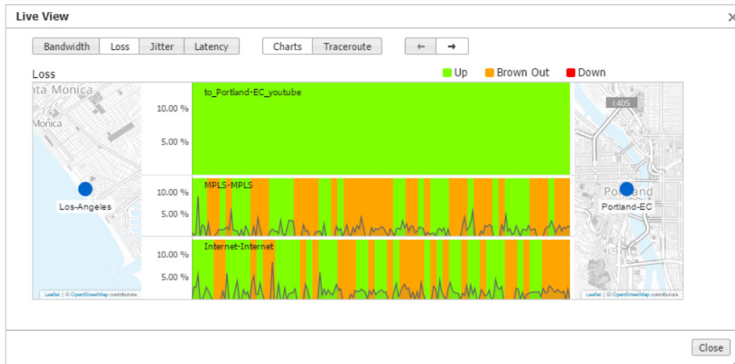
Figure 2: The Aruba EdgeConnect LiveView window displays the benefits of combining tunnel bonding, Path Conditioning and business intent overlays to deliver an uninterrupted video stream shown in solid green, despite the packet loss (orange) shown in the underlying MPLS and internet links.