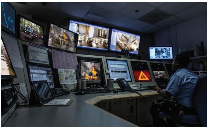
Figure 1: Monitoring industrial facilities using wired Ethernet PoE surveillance cameras.

As enterprise networks extend beyond offices to warehouses, industrial spaces, and outdoor facilities, challenging environmental requirements demand ruggedized Ethernet connectivity solutions that are secure, high performance, and simple to manage and deploy.