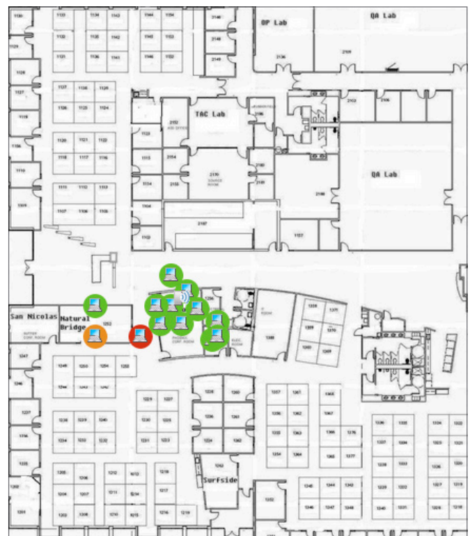
Figure 2: This floor plan shows an unhealthy client (red), which ClientMatch will automatically steer to a better AP and radio to optimize overall performance.

Client and AP performance are continuously monitored to ensure the best possible client experience. Clients are moved away from suboptimal APs during connection attempts and when a client's health degrades. For example, a client that connects to an AP with a weak signal will be moved to a more suitable AP (Figure 2), and a client that remains connected to an AP as it roams away (sticky client problem) will also be moved to a better performing AP it is closer to (Figure 3).