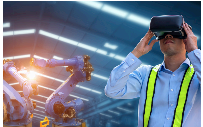
A growing number of enterprises are using latency-sensitive apps like AR/VR

Consistency in wireless experience has been a multi-pronged challenge with inconsistent bitrate, latency, and jitter for every application – this is despite existing QoS policies that prioritize certain applications.