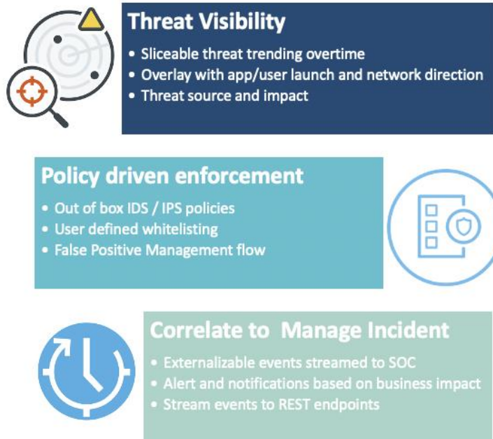
Figure 1: Aruba Branch security business use cases.

Aruba's security features solve for these use cases in both East-West (LAN) and North-South (WAN) scenarios: