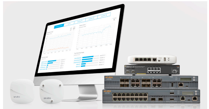
Aruba combines best-in-class wireless and wired infrastructure and management orchestration features with cost saving SD-WAN capabilities.

An Aruba headend gateway or virtual gateway is needed for VPN concentrator (VPNC) termination in hub-and-spoke topologies for IPsec VPN tunnels, and in data center routing scenarios. Aruba Virtual Gateways are deployed in public cloud infrastructures, such as an Amazon Web Services virtual private cloud (AWS VPC) or Microsoft Azure Virtual Network (VNet). These gateways serve as a virtual instance of a headend gateway to enable seamless and secure connectivity for all branch and data center locations connecting to public clouds.