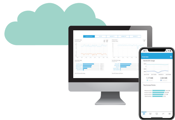
Figure 2. Aruba Central's cloud-based, mobile-friendly management platform