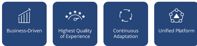
Figure 1: Forward-thinking executives choose the Aruba EdgeConnect SD-WAN platform

With more than 2,000 production deployments, customers have identified four unique areas of business value as the reasons they've chosen the Aruba EdgeConnect unified SD-WAN platform. The platform enables customers to build a unified WAN edge that is business-driven, delivers the highest quality of experience, continuously adapts to changing business needs and network conditions. It is designed to enable enterprises to fully realize the transformational promise of the cloud.