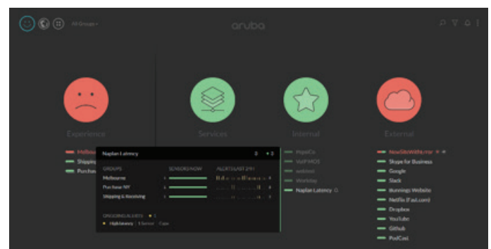
Figure 2: Aruba User Experience Insight: Administrator Dashboard

Mobile devices and IoT have become mission critical for the digital business and must be always-on with real-time access to applications and network services. To achieve this, IT needs a simple way to continuously monitor, measure, and track the complete end-to-end experience from any location. Aruba User Experience Insight (UXI) provides user and IoT device application assurance and rapid troubleshooting through easy-to-deploy sensors. By simulating end-user activities with admin-defined frequency, UXI sensors continuously perform user-centric application testing and store captured analytics for up to 30 days.